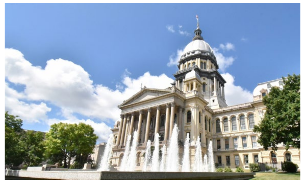
Illinois House of Representative of the House Minority Leader Now Hiring

The Illinois House of Representatives – Office of the House Minority Leader is wanting to give Illinois Community College Alumni a chance to work with the Illinois State Legislature.