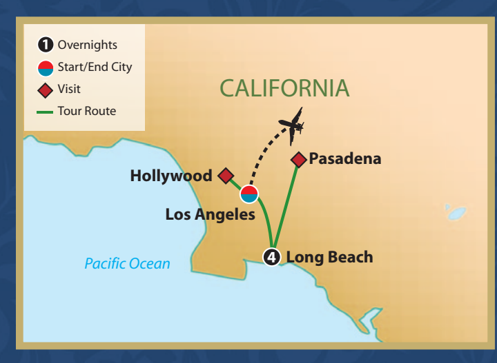
HOTEL ACCOMMODATIONS Renaissance Hotel, Long Beach, California