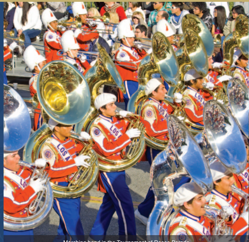
Marching band in the Tournament of Roses Parade