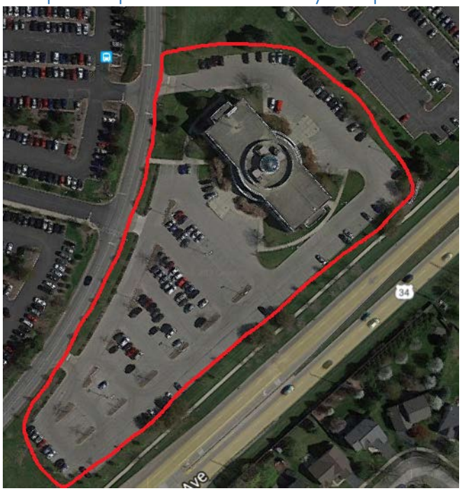
Campus Map – Plano Campus